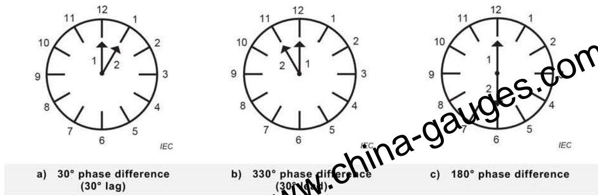
Figure 2 – Examples of hour numbers representing phase differences

NOTE On a clock where the hours are indicated by the numbers 1 to 12, the hour indicated by the number 12 is also representing the hour 0. Thus, in the examples and figures, the hour indicated by the clock position 12 is the hour 0.