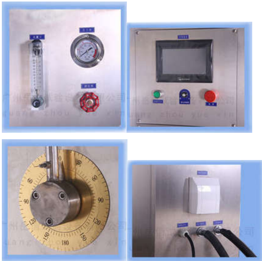
Figure 4 – Test device to verify protection against spraying and splashing water; second characteristic numerals 3 and 4 (oscillating tube)

NOTE The range of holes is shown as for second characteristic numeral 3 (see 14.2.3 a)).