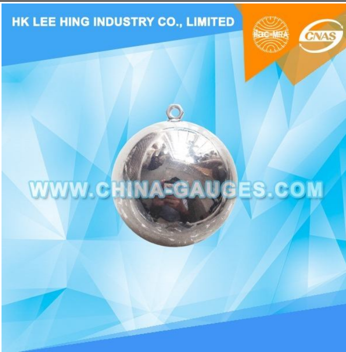
EN IEC 60950 Figure 4A / EN IEC 60065 Figure 8 - 50mm Impact Test Steel Ball with Ring